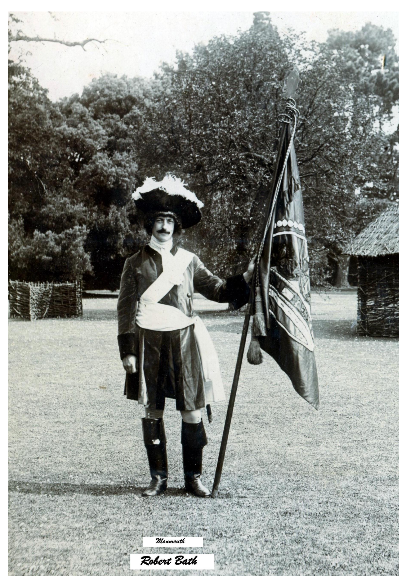
The banner sports a Butleigh Friendly Society brass pole head