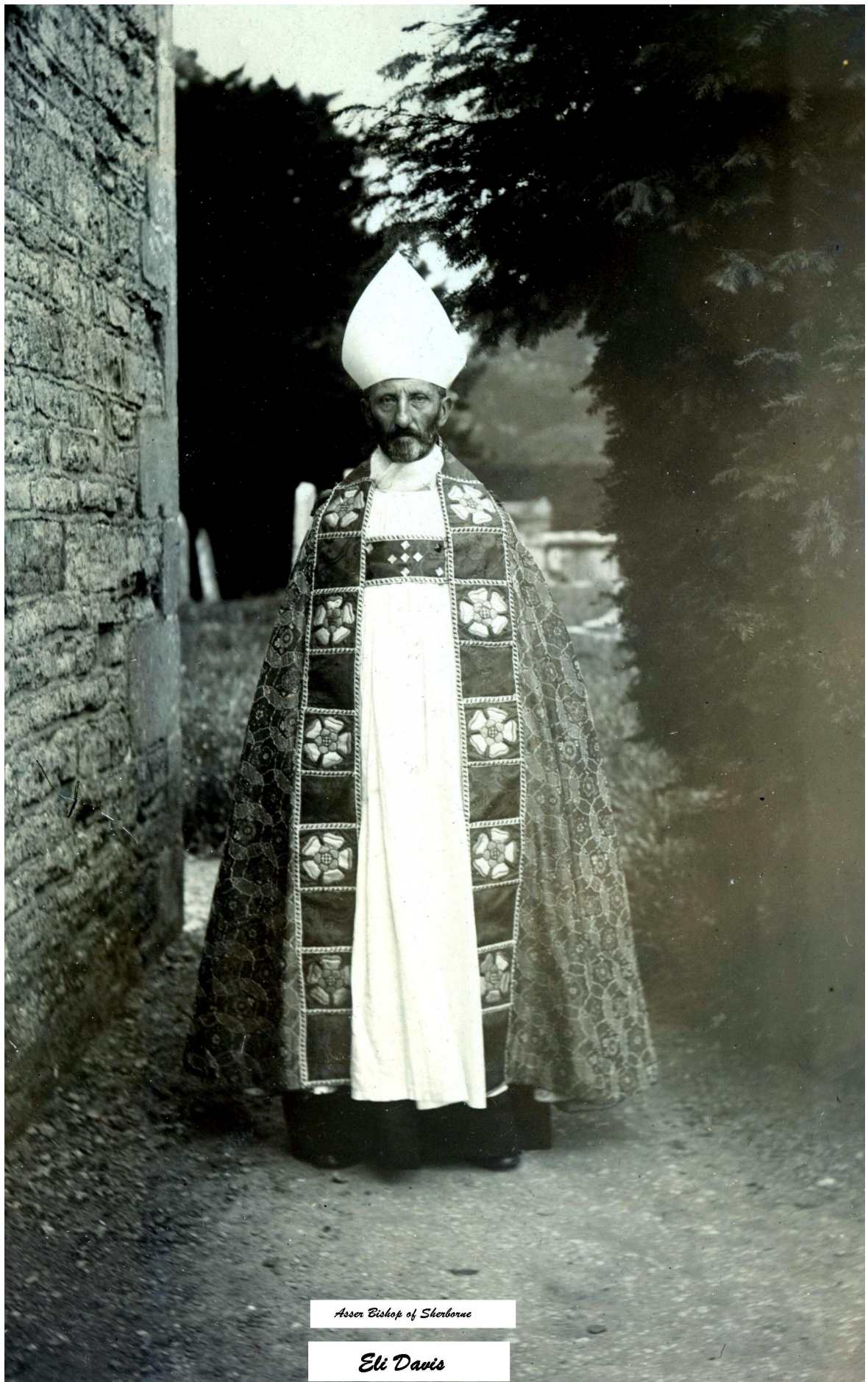
Assen Bishop of Sherborne