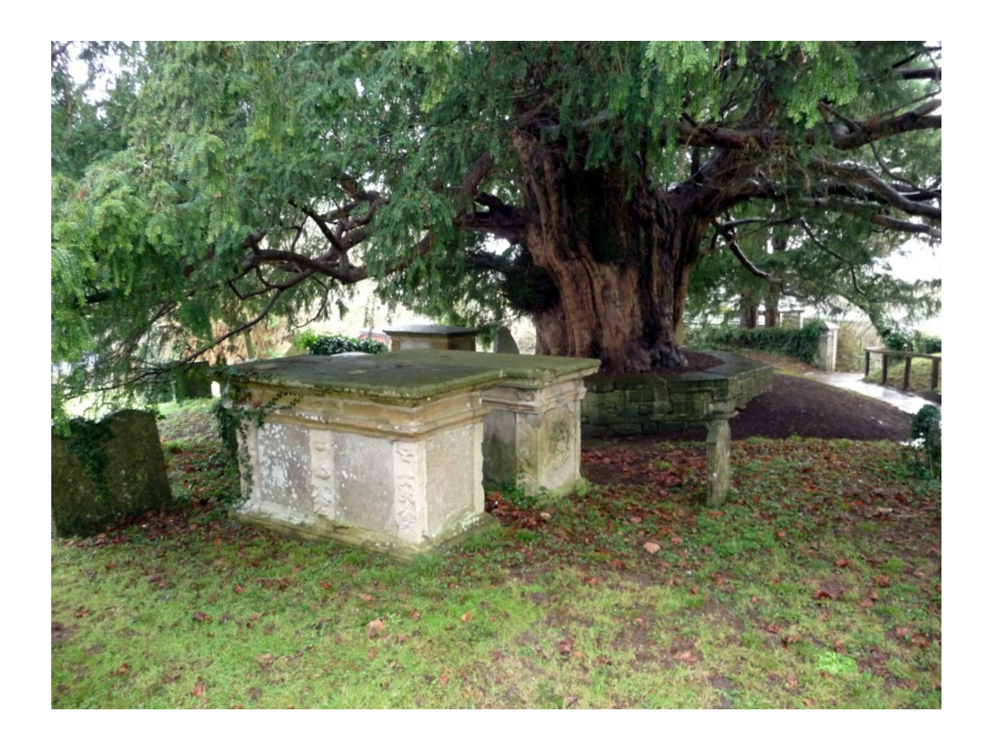
The Lymbry tombs

and Compton Dundon's 1,600 year old Yew tree